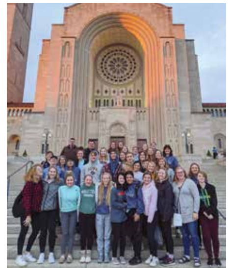
Students and Chaperones at the March for Life in Washington DC.