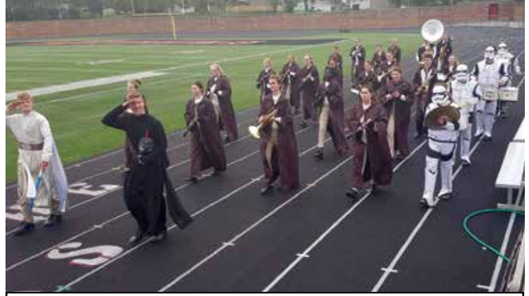
In the fall of 2019 the Marching Knights' show was Star Wars . The students worked diligently to learn three songs from the Star Wars movies and how to march to them in costume. The Marching Knights performed at halftime of home football games and at State Marching in Ft. Dodge where they earned a Division II Rating.