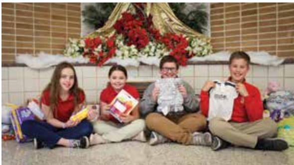
Fourth thru sixth graders hosted a "Baby Shower" for baby Jesus. Donations were made to the Carroll Area Storks Nest.