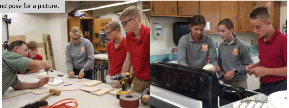
Woods and foods exploratory classes