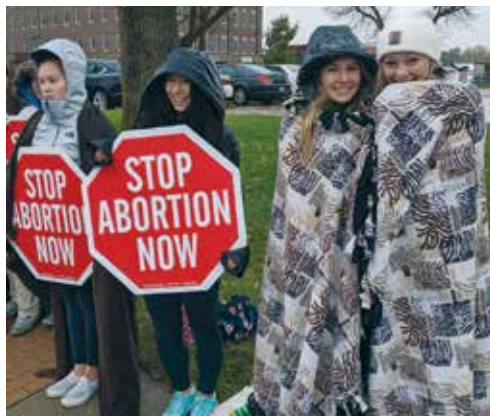
Students participate in silent protest along Highway 30 in Carroll.