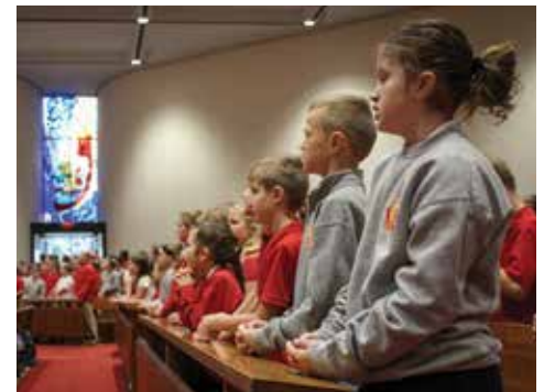
Grade School Mass